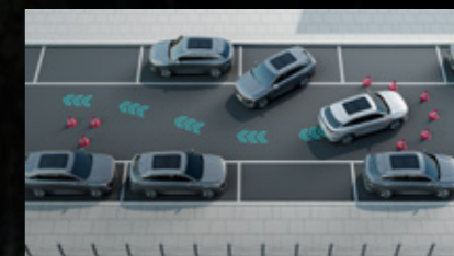
Intelligent Collision Avoidance System