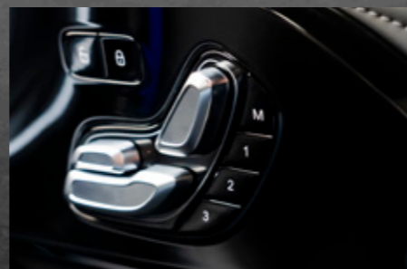
Driver Seat 6-Way Electric Adjustment with Memory Function