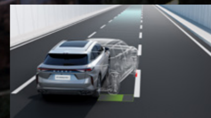
Lane Departure Warning & Lane Change Assist