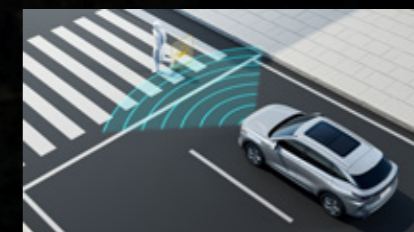
Automatic Emergency Braking