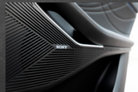
Sony Premium Sound System