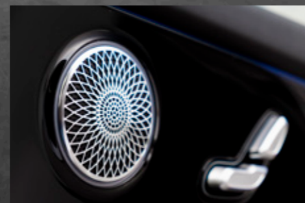
Integrated Fragrance System