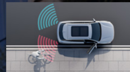
Door Opening Collision Warning