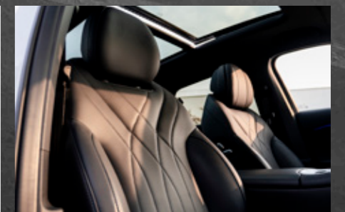
Heated & Ventilated Front Seats with Cushions and Backrests