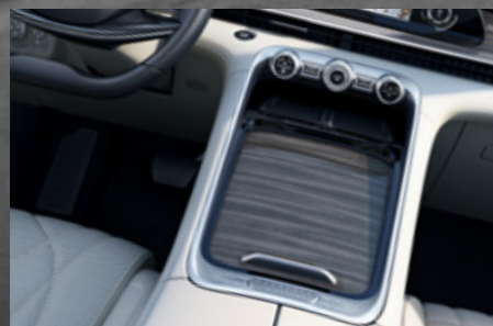
Armrest Box with Refrigeration and Heating