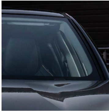
Driver & passenger mute glass