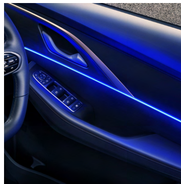
Ambient interior lighting