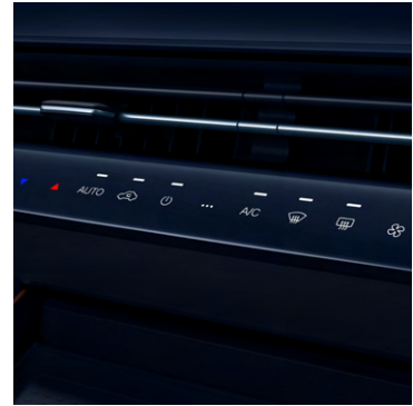
Dual zone automatic air conditioner