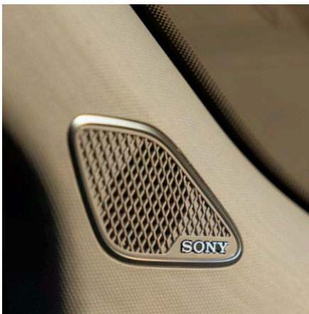
Sony sound system