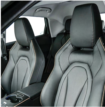
Powered leather sport seats

The C5 X-Series brings together luxury and comfort, delivering a drive that's both polished and relaxing.