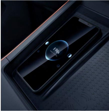
50W Wireless charging dock with air vent