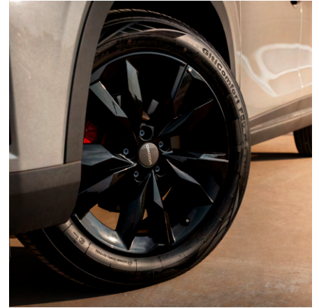
Black Sporty Rims