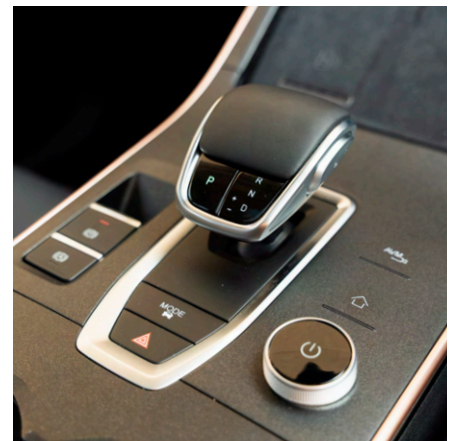
3 Driving Modes (Eco, Normal, Sport)