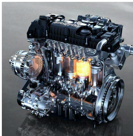
1.5T Engine & DCT Gearbox