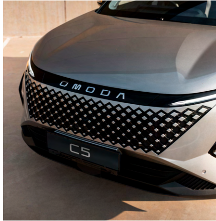
New Elegant Grille